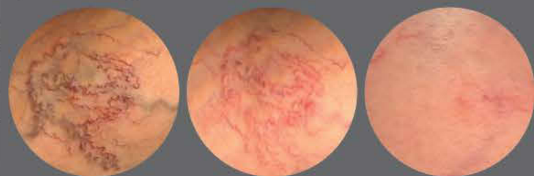
"Feeder" veins During treatment After treatment

The "feeder" veins are first treated using injection sclerotherapy (the "Gold Standard"), followed by the treatment of smaller spider veins using sclerotherapy or the revolutionary VeinGogh™ that utilizes a beam of radiofrequency light to permanently seal the unwanted veins shut.